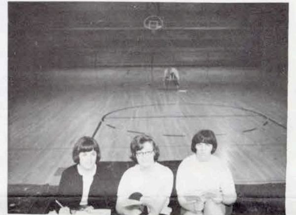
Student director and prompters