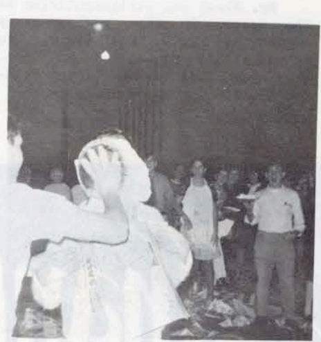
A SCENE FROM FRESHMEN INITIATION