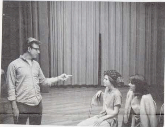
If I catch you with curlers once more....